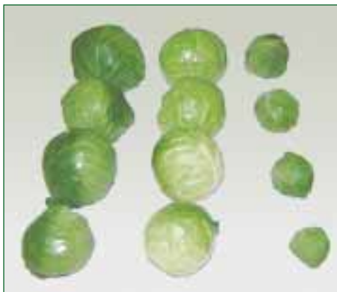
AGGRAND AGGRAND Plus* Miracle Gro®

Miracle Gro® was applied to the media every two weeks just like the AGGRAND treatments. Three ounces of the AGGRAND 4-3-3 Natural Fertilizer were mixed with one gallon of water to be applied to the media and to the leaves. For the Miracle Gro® treatments, one teaspoon of fertilizer was mixed with one gallon of water and applied to the media as stated in the directions. For the banded treatment at planting, two ounces